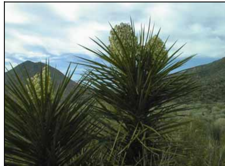
Picture of a Yucca Plant in a Southwestern United States Desert